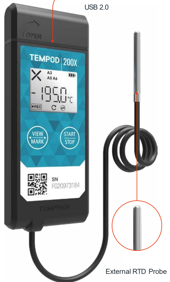
External RTD Probe